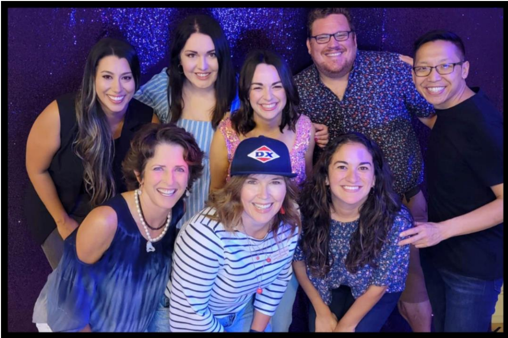
CCFI Launches Capital Campaign to Support Expansion Efforts

THANK YOU for attending Night at the Club!