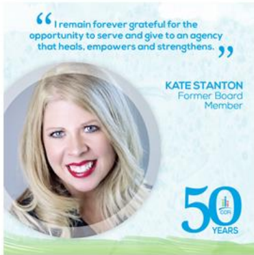
Learn more about KATE