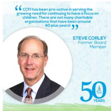
Learn more about STEVE