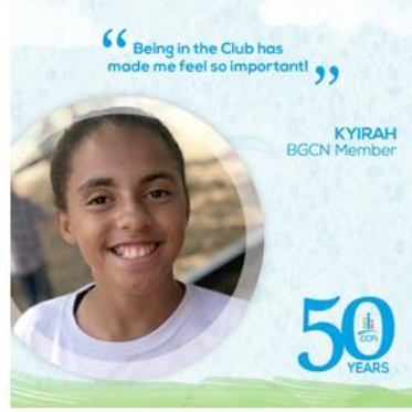
Learn more about KYIRAH