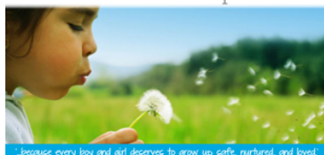
...because every boy and girl deserves to grow up, safe, nurtured, and loved.